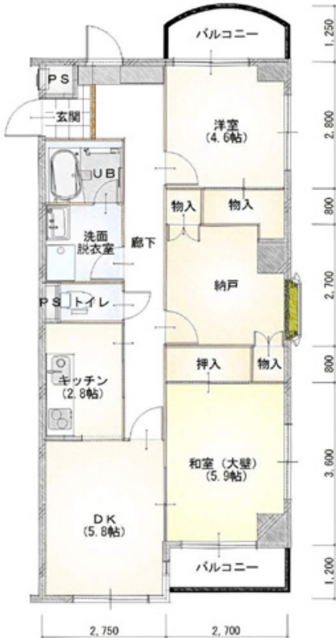
既存平面図 S : 1/50